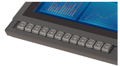
Optional: Line Keys